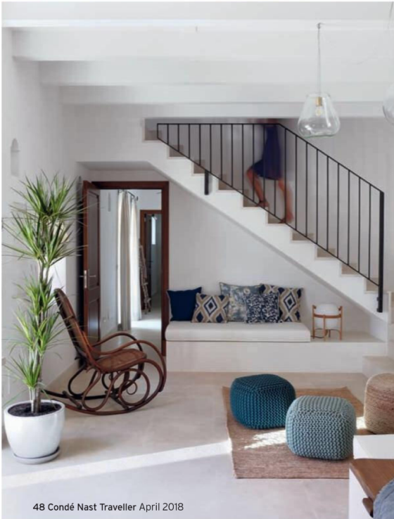
48 Condé Nast Traveller April 2018